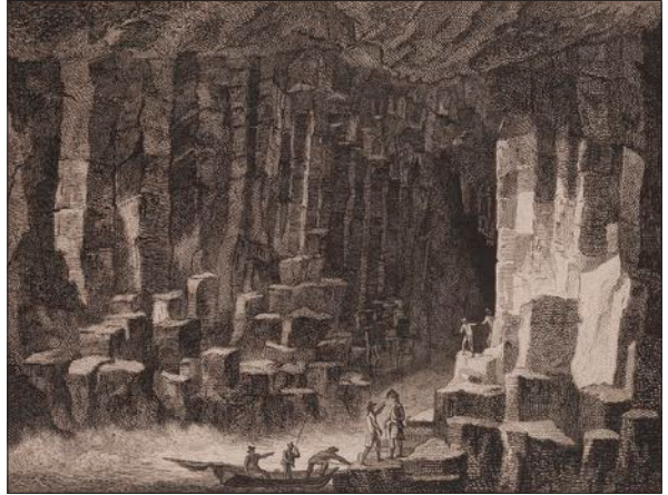
Fingal's Cave (circa 1802) – an inspiration for The Hebrides .

Travelling through Scotland, young Felix Mendelssohn was inspired by the rugged coastline, the isolated islands to the North, and the sights, smells, and sounds of the stormy Atlantic. He constructed this masterpiece of tone-poetry, which creates impressions of overlapping waves that build to overwhelming storm before dissolving into the cries of gulls and calm serenity.