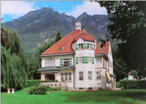
The Strauss-Villa, in which the Oboe Concerto was written.

During World War II, Richard Strauss had witnessed the destruction of the cultural edifices of his homeland and the murder of Jewish family members and artistic collaborators. In its aftermath, Strauss experienced a late artistic flourishing, including this Concerto for Oboe and Small Orchestra . Musically, the concerto looks inwards and backwards, to the spirit of the waltz and the grace of